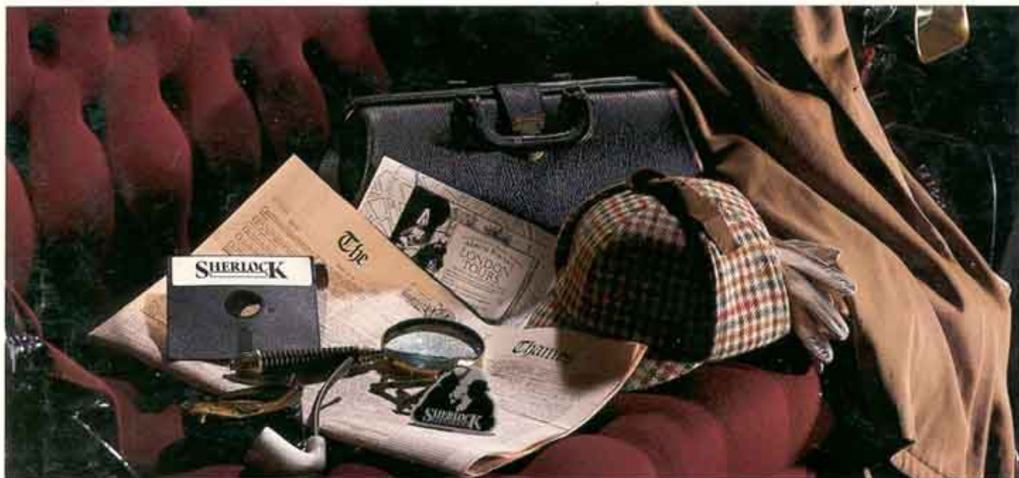
Regally arrayed inside every The Riddle of the Crown Jewels package: a tourist map of Victorian London; a copy of the June 17, 1887 "London Thames"; and a distinctive key fob.