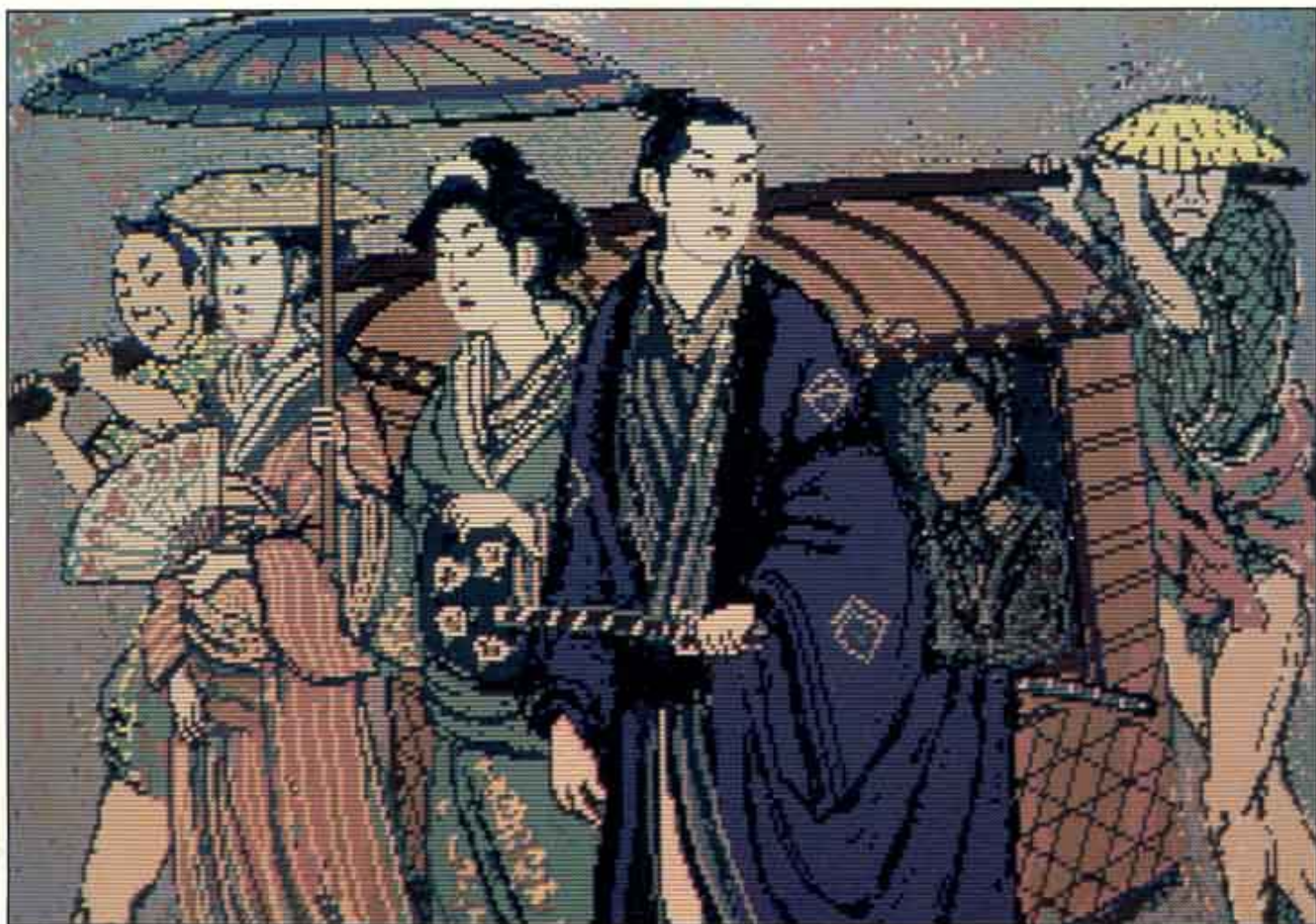
The potent action and adventure of Shogun come alive on your computer screen.