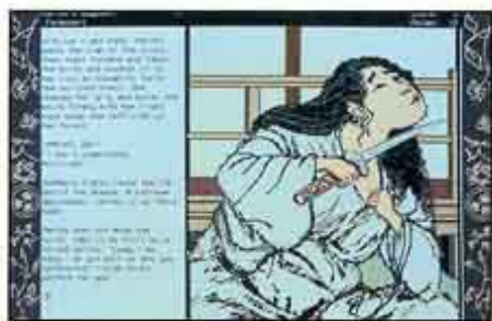
The beauty of color graphics combine with the richness of Infocom's storytelling to bring you unforgettable entertainment.

In this interactive adaptation, Dave Lebling—co-author of the enormously popular Zork ® series—captures all the drama and spell-binding style of James Clavell's matchless novel. Color graphics