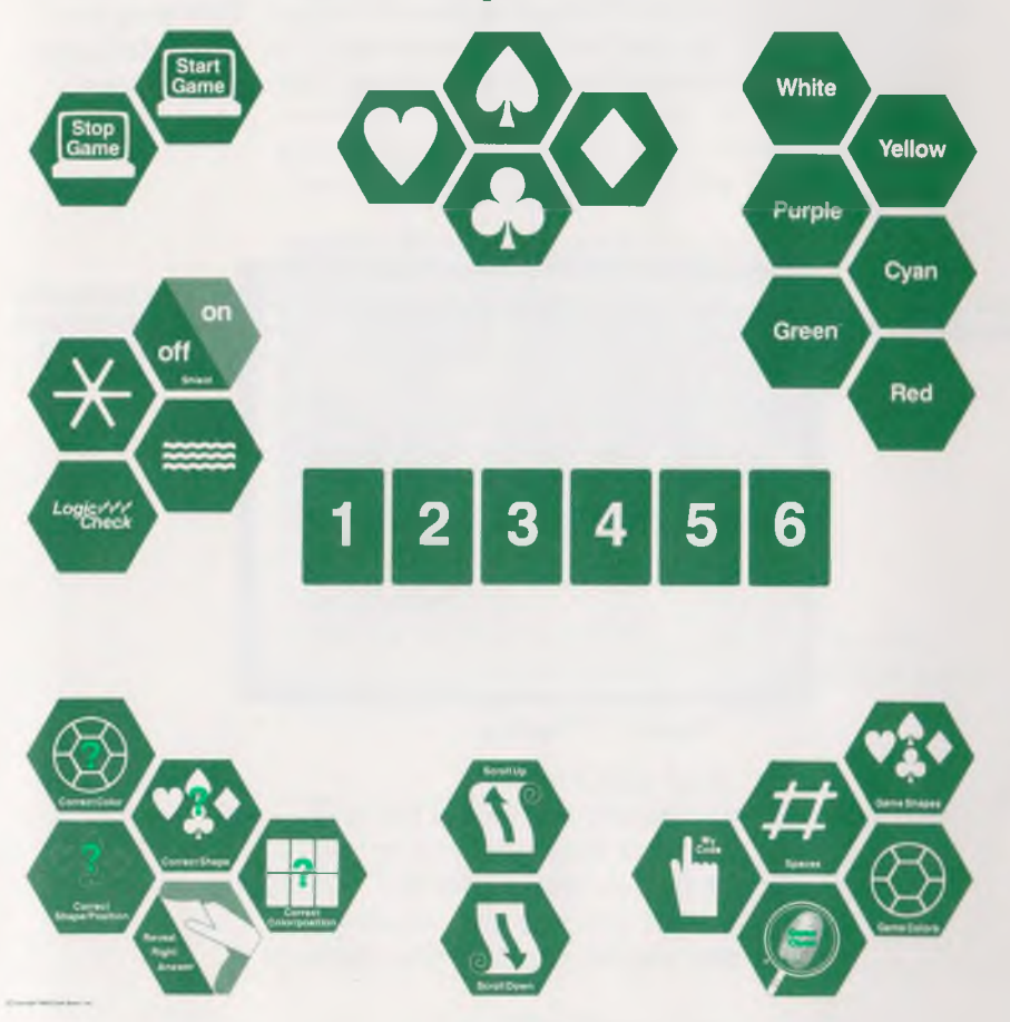
Figure 1. Overlay

Now, take a few minutes to look at the different buttons. The large buttons at the top and right represent the colors and shapes used to enter and solve the secret code. The buttons at the bottom of the overlay are the commands you use to design your games. The numbered space buttons in the middle of the overlay identify the positions used to design, enter and solve the secret code. The buttons on the left side of the overlay are used for stopping and starting games, as well as for receiving clues from the computer.