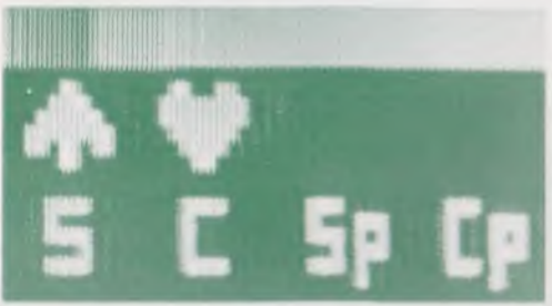
Figure 3. Choice Box

Before you start, look at the screen. The screen displays information about the secret code including the possible colors, shapes, clues and number of spaces in the code for this sample game. This information is contained in the choice box and code box on the screen.