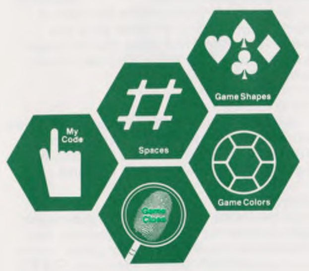
Figure 5. Design Commands