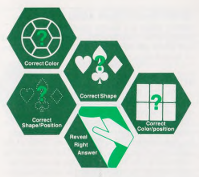
Figure 6. Clue Commands