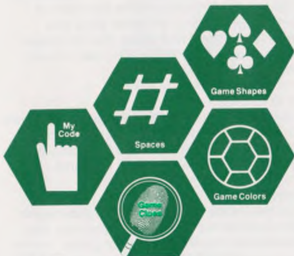
Figure 5. Design Commands

Before you begin to design your own game, you must finish the current game. (You must either solve the secret code, or press STOP GAME. )