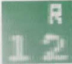
Figure 4. Code Box

Notice the box at the top left of the screen. This is the code box . The code box has two parts: the secret code line and the break code line.