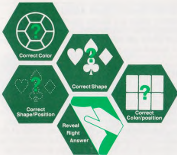
Figure 6. Clue Commands