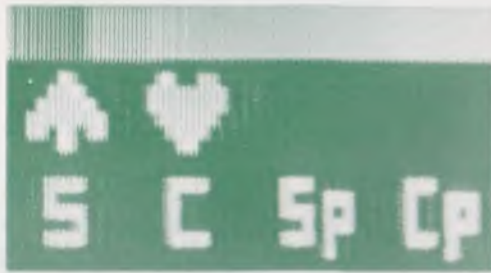
Figure 3. Choice Box

Before you start, look at the screen. The screen displays information about the secret code including the possible colors, shapes, clues and number of spaces in the code for this sample game. This information is contained in the choice box and code box on the screen.