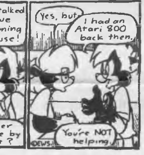
Sabrina Online by Evil Schwarty 2000